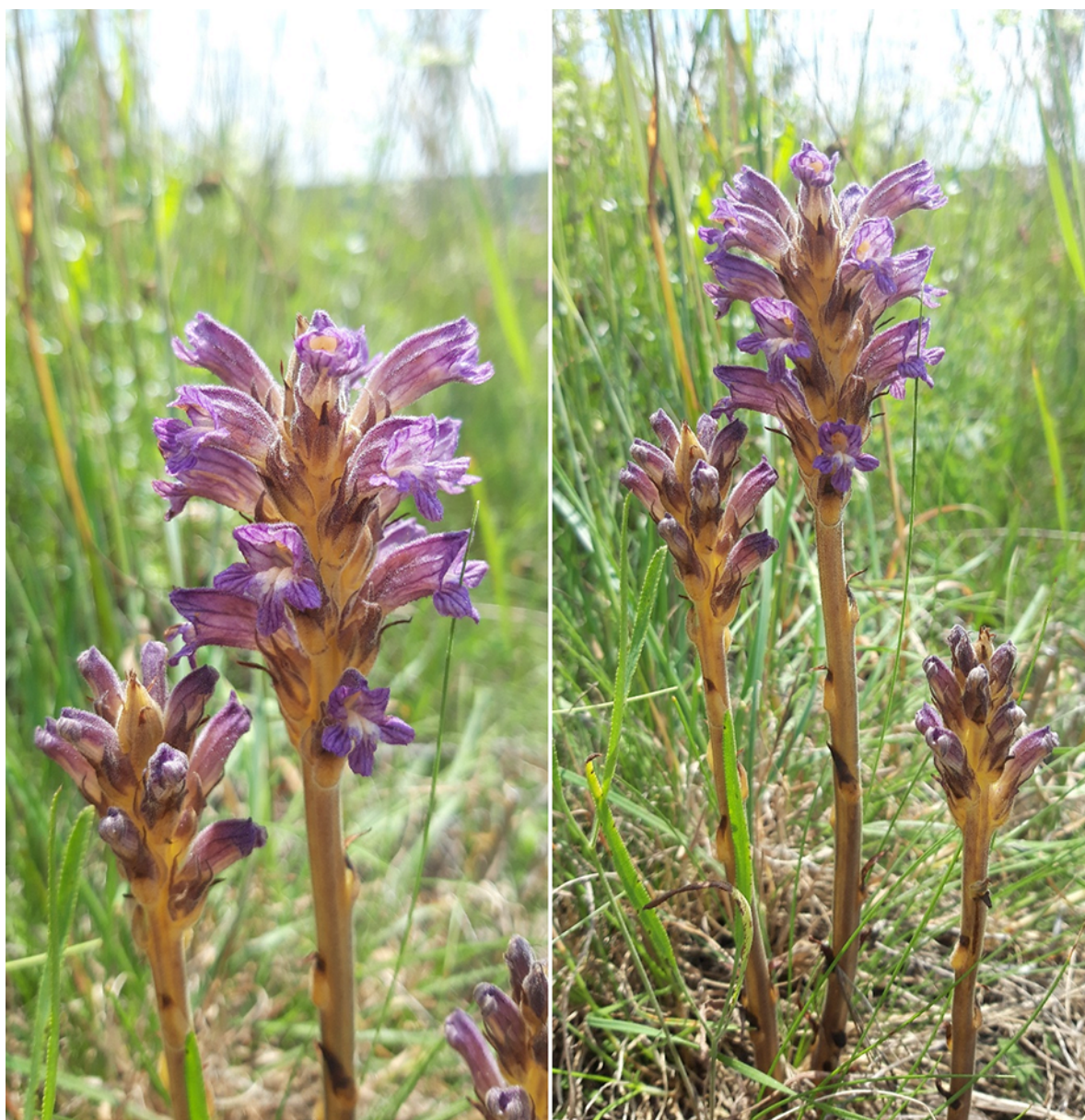
Figure 2 Phelipanche bohemica in the newly discovered locality in Korzecko near Chęciny. June 27, 2020.

Artemisia campestris 1, Brachypodium pinnatum 1, Securigera varia 1, Dianthus carthusianorum 1, Euphorbia cyparissias 1, Fragaria viridis 1, Hypericum perforatum 1, Koeleria macrantha 1, Melampyrum arvense 1, Thymus glabrescens s. str. 1, Veronica spicata 1, Achillea pannonica +, Asperula cynanchica +, Campanula sibirica +, Carex caryophyllea +, Chamaecytisus ruthenicus +, Centaurea scabiosa +, Euphorbia esula +, Falcaria vulgaris +, Galium album +, Helianthemum nummularium subsp. obscurum +, Lotus corniculatus +, Medicago falcata +, Phelipanche bohemica +, Pimpinella saxifraga +, Plantago lanceolata +, Potentilla arenaria +, Prunella grandiflora +, Sanguisorba muricata +, Senecio jacobaea +, Seseli annuum +, Silene vulgaris +, Thesium linophyllum +, Vincetoxicum hirundinaria +, Viola collina +.